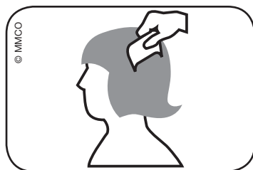
Fig. Combing through wet hair with a fine comb: from the roots to the tips of the hair